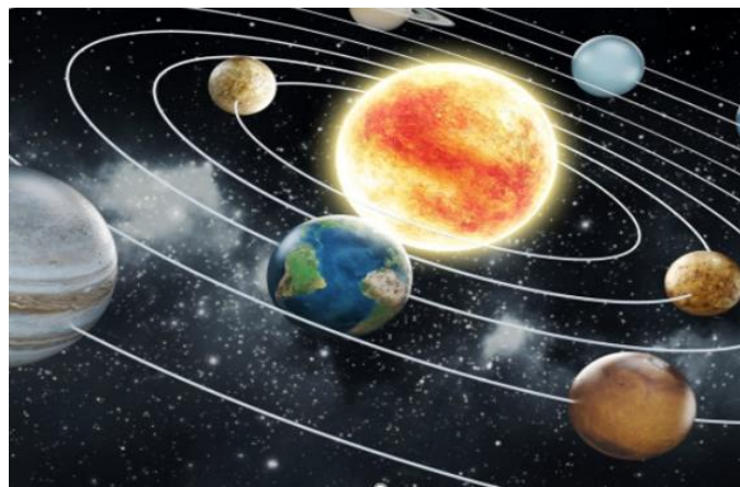
Copernicus helped humanity to start to understand the true nature of the solar system.

Prior to the middle of the 1500s CE, many people believed Earth was an immobile object and that the celestial bodies of space, such as the sun, stars, and planets, were moving around it. The Earth was considered to be the center of the known universe. This was called the geocentric theory. Though observational experience made those on Earth appear to be viewing a universe spinning around our planet, figuring out this was an incorrect view played a huge role in propelling humanity toward the scientific revolution.